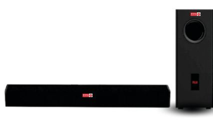
Sound Bar Output Power - 70W