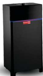
Speaker Rock - 600 Output Power - 60W