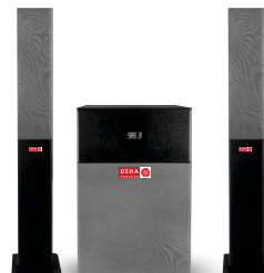
Sound Box Output Power - 90W